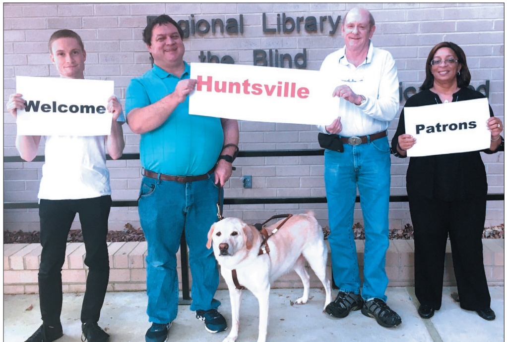
BPH now serves patrons in 64 counties out of the Regional Library in Montgomery

With the Huntsville Subregional Library closing on Dec. 31, 2020, BPH now serves patrons in 64 Alabama counties. A subregional