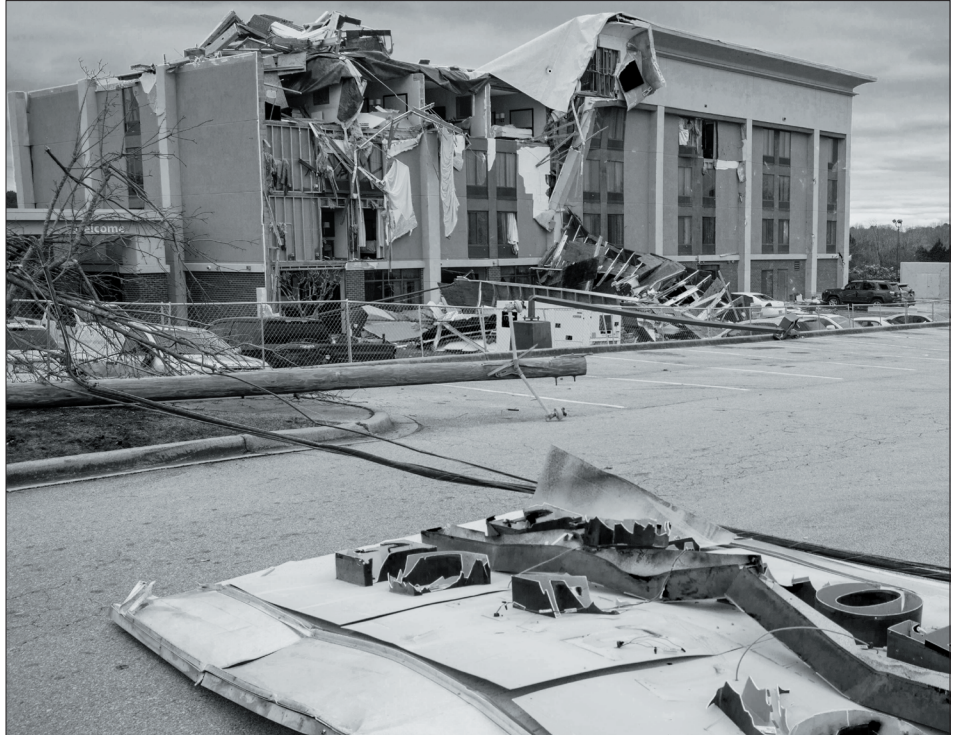
Damage in Fultondale, Ala. from a January 2021 EF3 tornado

https://alabamane.wscenter.com/2021/02/26/severe-weather-awareness-week-2021-receiving-weather-alerts/